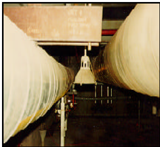
Figure 1. Sagging ( Left) vs. Straight Pipe

Power and process piping systems operating at high temperatures (in the creep range) may undergo large permanent deformations as they age ( Fig. 1 ). This sagging may lead to failure of pipe supports, pressure boundary attachments, branch connections, and, ultimately, the piping system. A major fossil plant hired MIS to find the cause of continuous sagging of a main steam