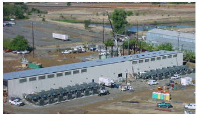
Generator Building Showing Radiators

Red Bluff #1 Power Station was designed such that each generator lineup was an exact copy of the other. This technique reduced engineering time and simplified construction. Incorporating innovative engineering techniques helped expedite the project without sacrificing design integrity.