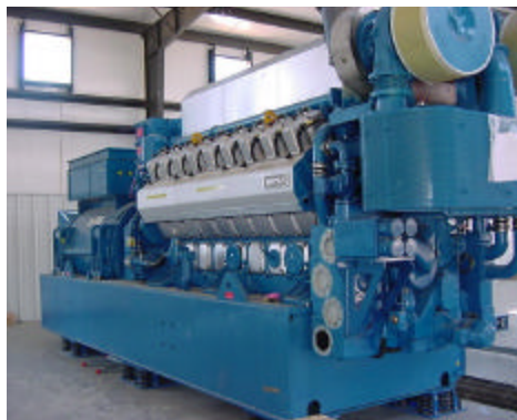
Wartsila 18V220SG Genset.

Each of the 16 gensets produces a gross electric output of approximately 2,800 kW. Approximately 42.8 net MW of electricity is supplied to the grid with all gensets at full load. The facility design allows peaking power to be supplied in