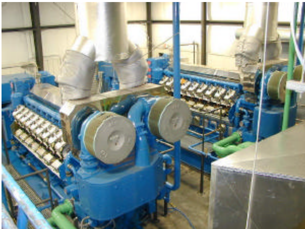
Wartsila 18V220SG Gensets

Olympic View Power Station is a 5.6 MW power plant incorporating 2 natural-gas-fueled engine-generator sets. The plant is designed to be manned or operated remotely depending on load requirements. The physical structure of the plant consists of a single building separated into engine and control rooms, with the engine room housing two Wartsila 18V220SG engine-generator sets and their associated auxiliary and control equipment.